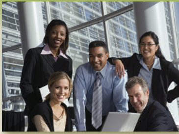
FIGURE 1.4 Communication and Collaborative Technologies