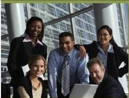
Exhibit 1.10, Communication Technologies